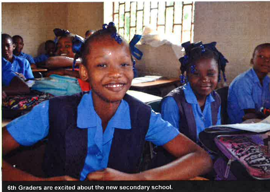
6th Graders are excited about the new secondary school.