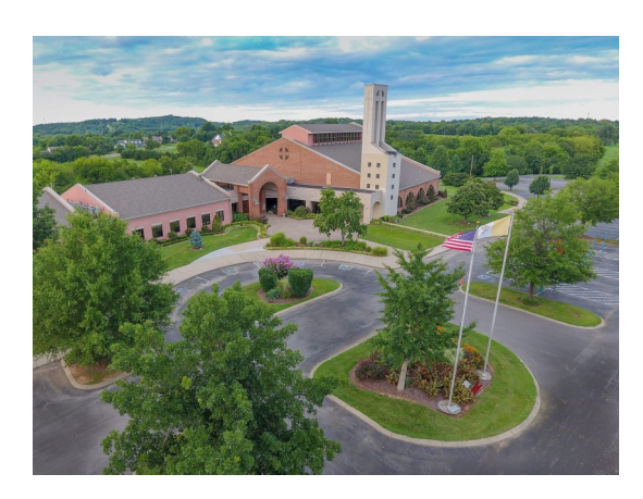
Our Lady of the Lake Catholic Church 1729 Stop 30 Road Hendersonville, Tennessee 37075