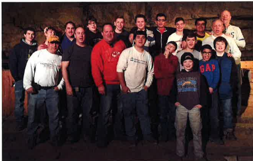
The OLQL Fraternus Chapter at Cumberland Caverns