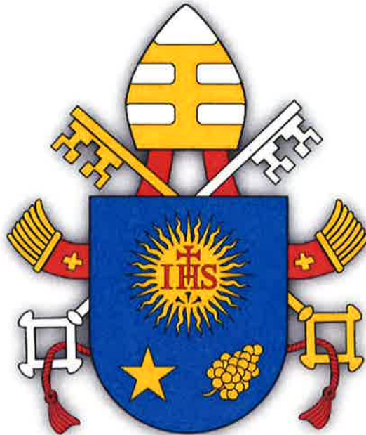
Pope Francis Coat of Arms

"I place trust in God, my creator, in all things; I love Him with all my heart." (St. Joan of Arc)